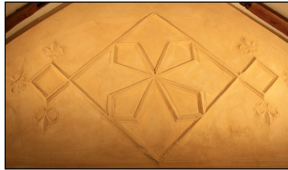
Lime plasterwork in the Chapel at Lydart Farm

Continue straight up to the corner of the hedge (3).