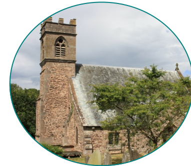
Church of St Michael and All Angels