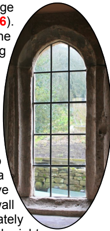
Late 15th century Lydart window

At the wall, turn left, keeping tight to the wall on your right. Go over a stile and continue to the top of the driveway to New House Farm (7). Do not go onto the road but continue across the top of the field above the farm-house. Keep close to the wall on your right up to a pedestrian gate next to a stile, with an eye out for adders basking in this old stone wall and the bee-hives on the left immediately after the gate! After the gate bear slightly right (8) to walk through the next field with the hedge on your left.