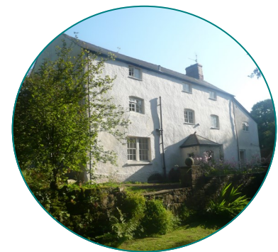
Church Farm Guesthouse